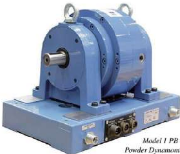
Model 1 PB 115 Powder Dynamometer