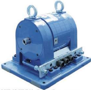
Model 1 WB 65-HS Eddy-Current Dynamometer